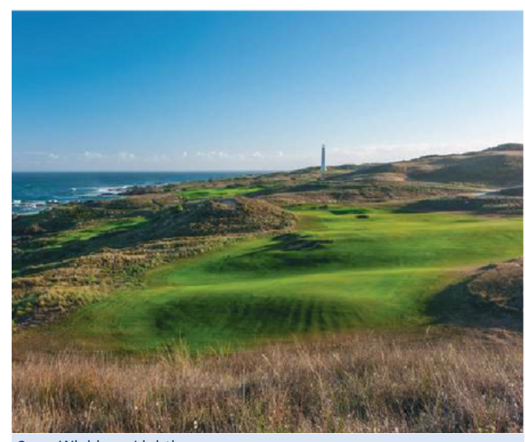
Cape Wickham Lighthouse