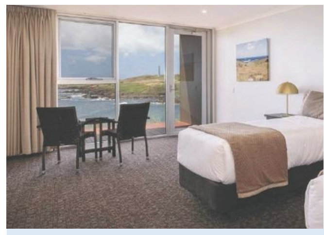
Cape Wickham Accommodation