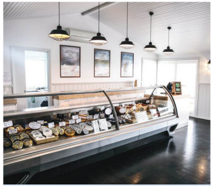
King Island Dairy