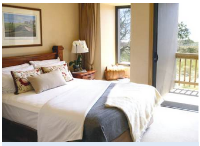
Lost Farm Lodge

Meals and drinks, motorised cart or club hire. Green fee and accommodation surcharge for international players applies at both Cape Wickham and Ocean Dunes enquire for details.