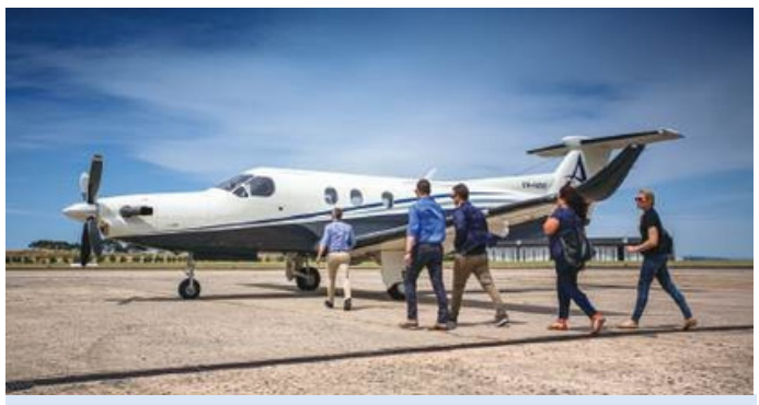
Air Adventure's Pilatus PC12