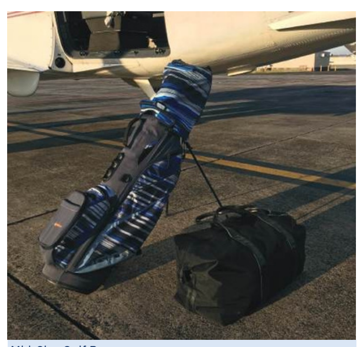
Mid-Size Golf Bag

Yes! At Barnbougle and Lost Farm, all-day golf can be added for an extra $31 (on the same course as your morning round), or you can play the 14-hole Bougle Run for $115, which includes a pull buggy. On King Island, all-day golf at Cape Wickham and Ocean Dunes is an extra $45, but this is included as a free upgrade when staying on course at Cape Wickham.